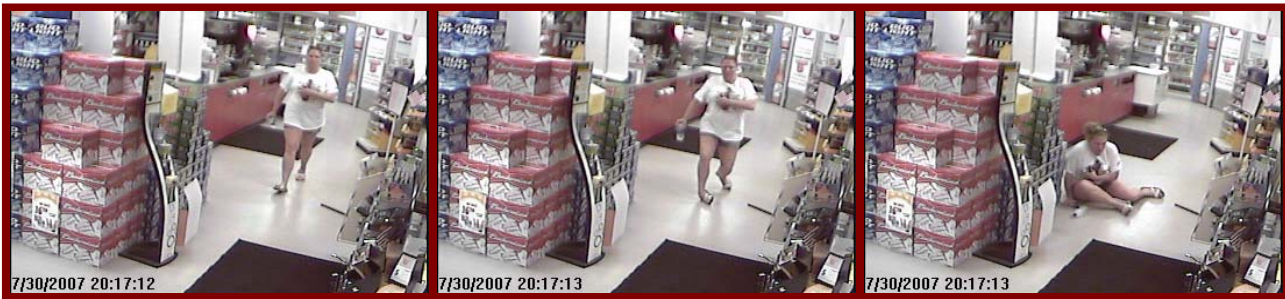
Photo series detail how the young lady fell after turning an ankle. Her lawyer claimed she tripped over an out of place

Quality systems limit your exposure to spurious lawsuits by providing an accurate and permanent digital record of the event(s) in question.