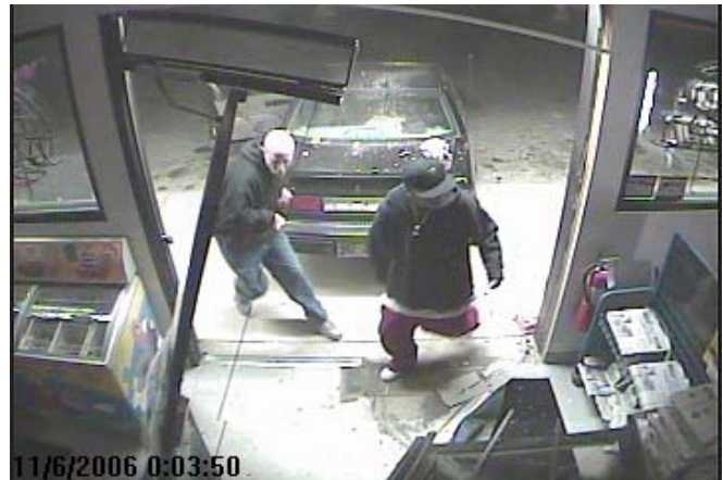
Midnight robbery foiled by GSS Video Criminals now safely behind bars

"As money becomes tighter, we are seeing far more thefts than ever before. GuardDog's Surveillance Systems have been a huge help in quickly resolving these issues so we can move on to more productive business."